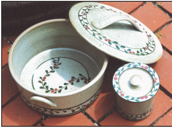
Partridge Berry large casserole dish with side handles and butter tub