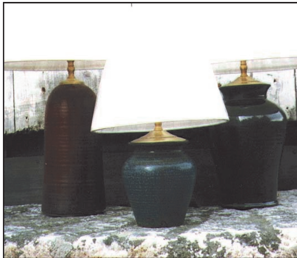
Lamps shown in Colonial Red , Antique Blue and Forest Green