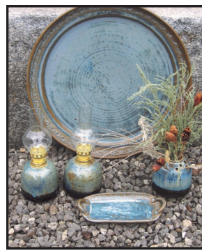
Rutile 15" platter, miniature kerosene lamps, posy pot & butter tray