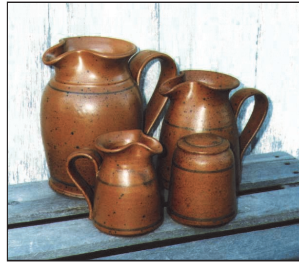
Pumpkin pitchers, creamer and sugar bowl