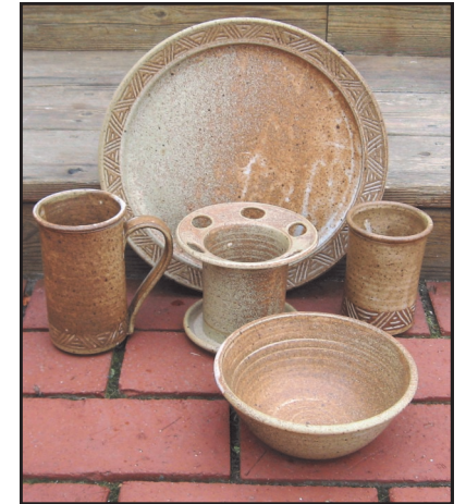
Parchment with brown jungle tall straight mug, toothbrush holder, dinner plate, cereal bowl & tumbler