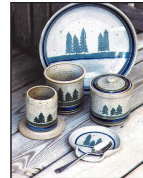
Allagash butter keeper, medium pasta, jam jar and spoon rest