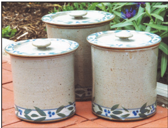
Blueberry crock-style canister set of 3 Other styles available upon request