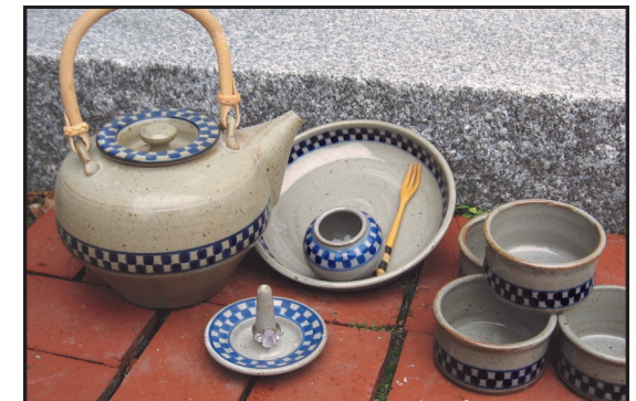
Blue Check teapot, ring holder, olive/cherry serving set (3 pcs. incl. fork) and ramekins