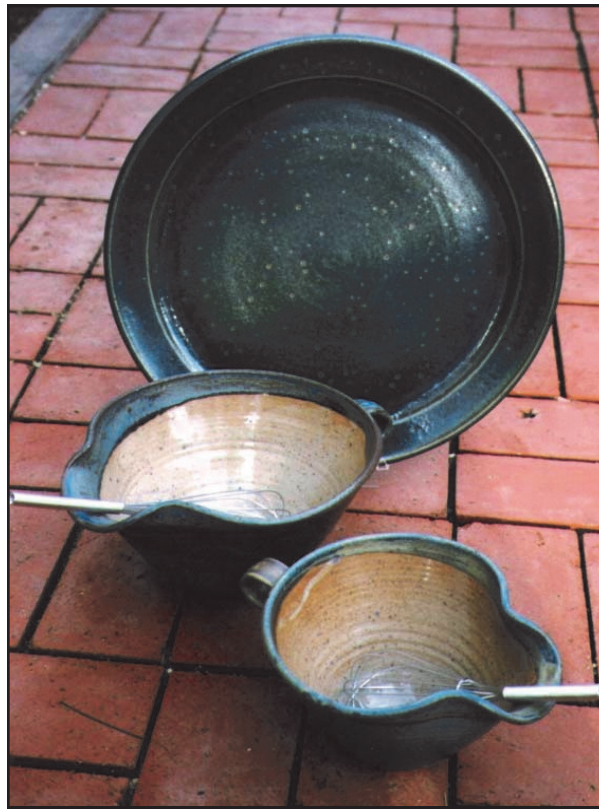
Forest Green platter with Antique Blue batter bowls