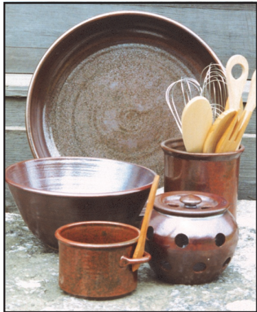
Persimmon medium deep serving bowl, utensil holder, garlic keeper and paté pot