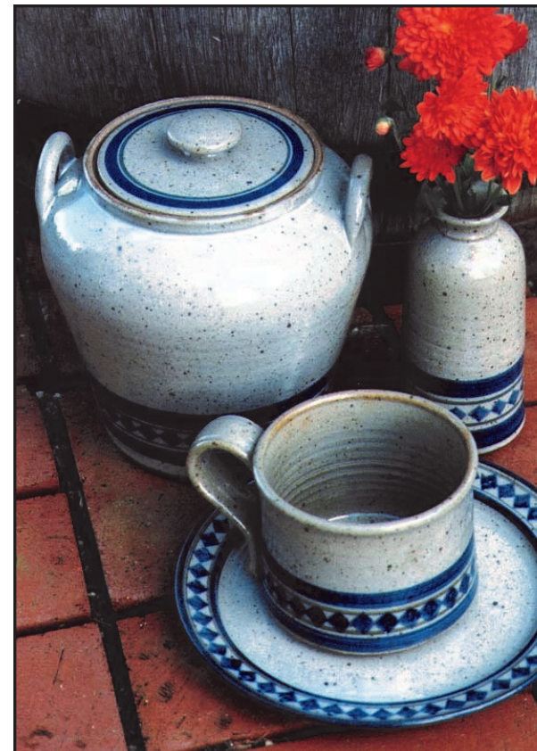
Blue Mission bean pot, bud vase, chowder mug and luncheon plate